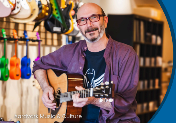
Aardvark Music & Culture