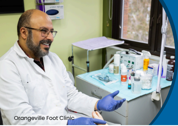
Orangeville Foot Clinic