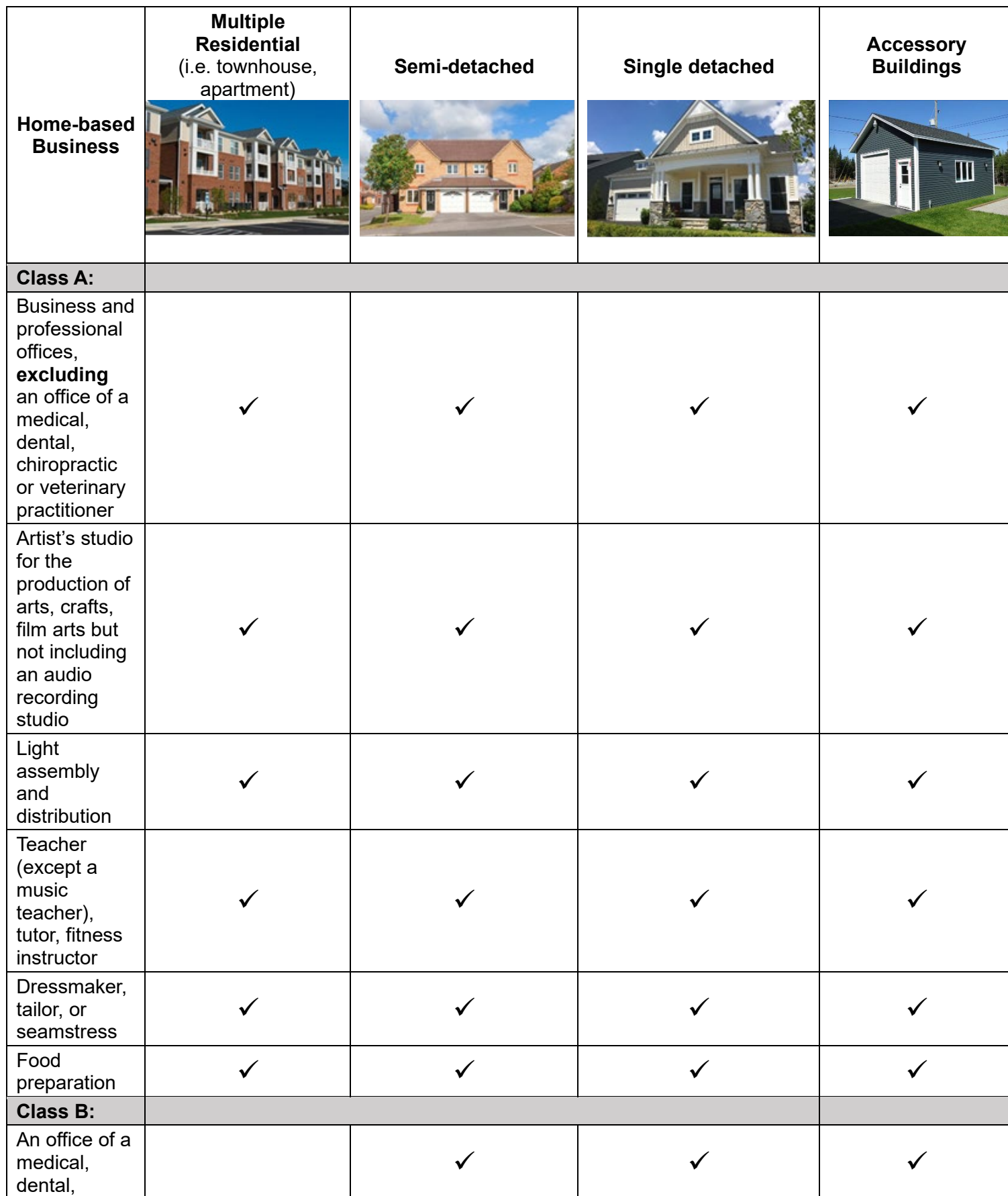
Table 1: Types of home-based businesses permitted in different dwelling types.